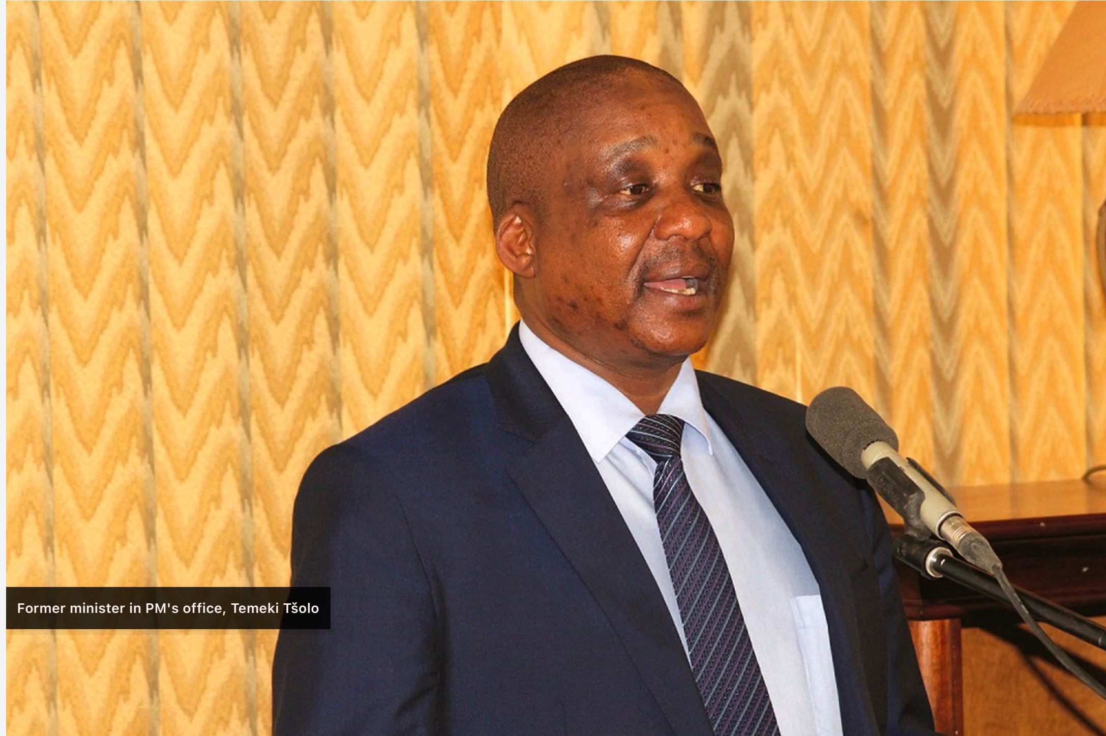
Former minister in PM's office, Temeki Tšolo